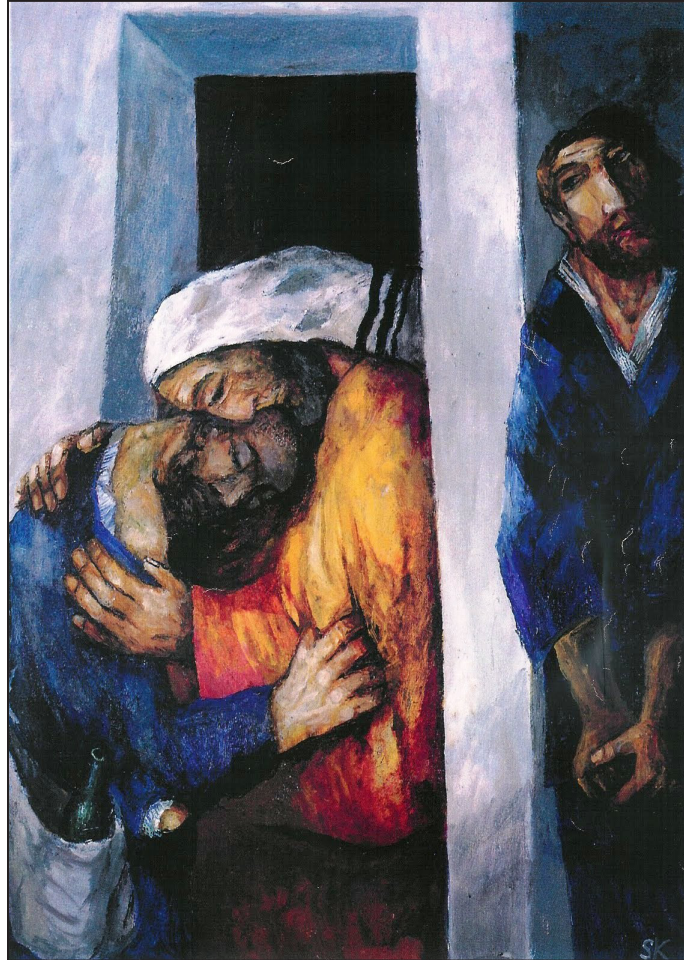
Home by Sieger Köder