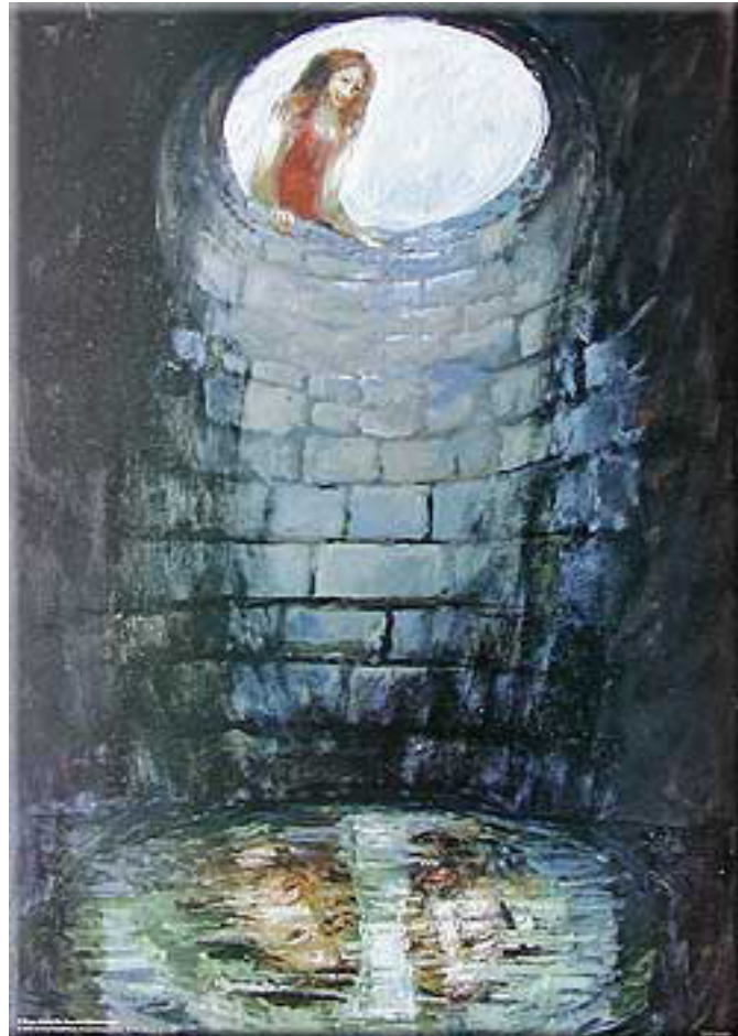
Insight by Sieger Köder

God, help us to look for you, not only where it appears that you obviously must be, but also where it appears that you obviously cannot be.